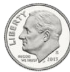
Dime = 10¢