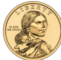
Gold dollar coin (or, Sacagawea coin) = $1