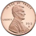
Penny = 1¢

Coins are a fraction of the U.S. dollar. These fractions are known as cents ( \text{¢} ). There are 100 cents in a dollar.