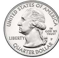
Quarter = 25¢

You may see two other coins that are far less common, but still legal: