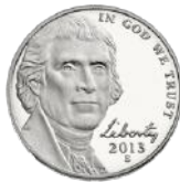
Nickel = 5¢