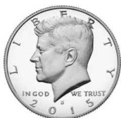
Half-dollar = 50¢

You may see two other coins that are far less common, but still legal: