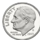
Dime = 10¢