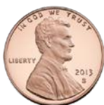
Penny = 1¢

Coins are a fraction of the U.S. dollar. These fractions are known as cents ( \text{¢} ). There are 100 cents in a dollar.