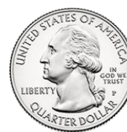
Quarter = 25¢

You may see two other coins that are far less common, but still legal: