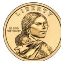
Gold dollar coin (or, Sacagawea coin) = $1