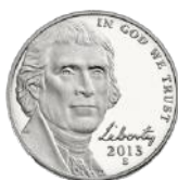
Nickel = 5¢